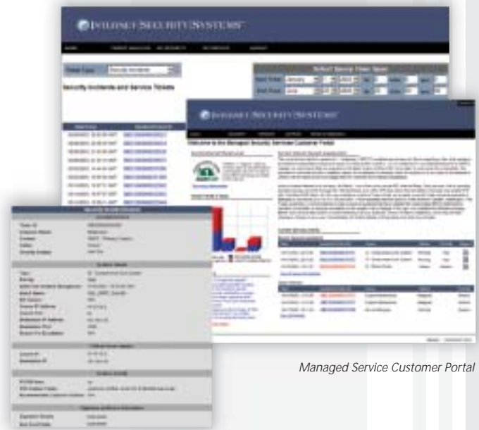
Managed Service Customer Portal

Internet Security Systems' X-Force is the most respected security intelligence and research organization in the industry. This elite research team monitors and gathers security intelligence from over 5000 sources around the globe, rapidly turning security research into product and service improvements. Using a first-to-market approach, X-Force security professionals have delivered more than 53% of the industry's high-risk advisories for critical Internet threats in products from Cisco®, Microsoft®, IBM®, Sun®, Hewlett-Packard®, Oracle®, Peoplesoft®, BMC®, Polycom®, Apache™ and many more. X-Force's excellence in global security intelligence is also evident by its contribution to ensuring the security of national critical infrastructure. In fact, it holds the distinction of hosting the IT Information Sharing Analysis Center (IT-ISAC) on behalf of the information technology industry. By researching critical security issues, tracking the evolution of threats through its Global Threat Operations Center and quickly converting knowledge into protection, X-Force has proven its status as the unequivocal authority on threats and vulnerabilities.