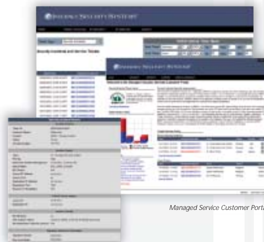
Managed Service Customer Portal

Information Sharing Analysis Center (IT-ISAC) on behalf of the information technology industry. By researching critical security issues, tracking the evolution of threats through its Global Threat Operations Center and quickly converting knowledge into protection, X-Force has proven its status as the unequivocal authority on threats and vulnerabilities.